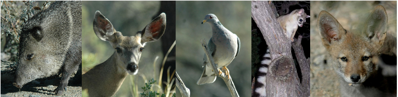
Left to Right: Javelina, Juvenile Male Mule Deer with antler nubs, Band-tailed Pigeon, Ringtail, and Coyote Pup

Yet many Ranch owners enjoy watching our theater of nature of newborn mule deer or javelina babies meandering through the lawn, the night visits of a rare western spotted skunk or shy ringtail, or observing and studying the colorful assortment of reptiles and bird species that live and migrate through the area. The past few months, several Ranch folks have enjoyed watching the growth of the coyote pups near the Bullwhacker Ranch entrance. Following their wild nature, the pups have also been seen at night seeking food around the Gateway Mall.